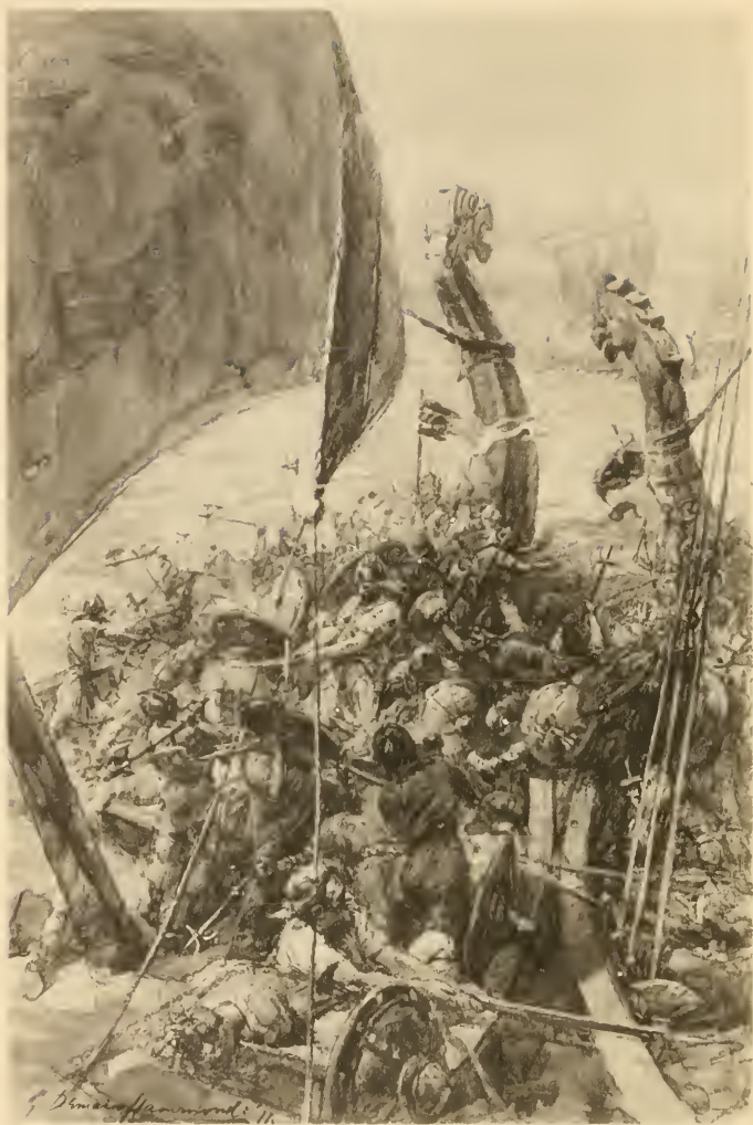
Harald slays King Arvid. (page 86)