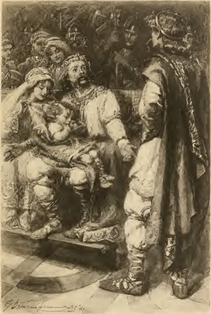
"What is this child?"