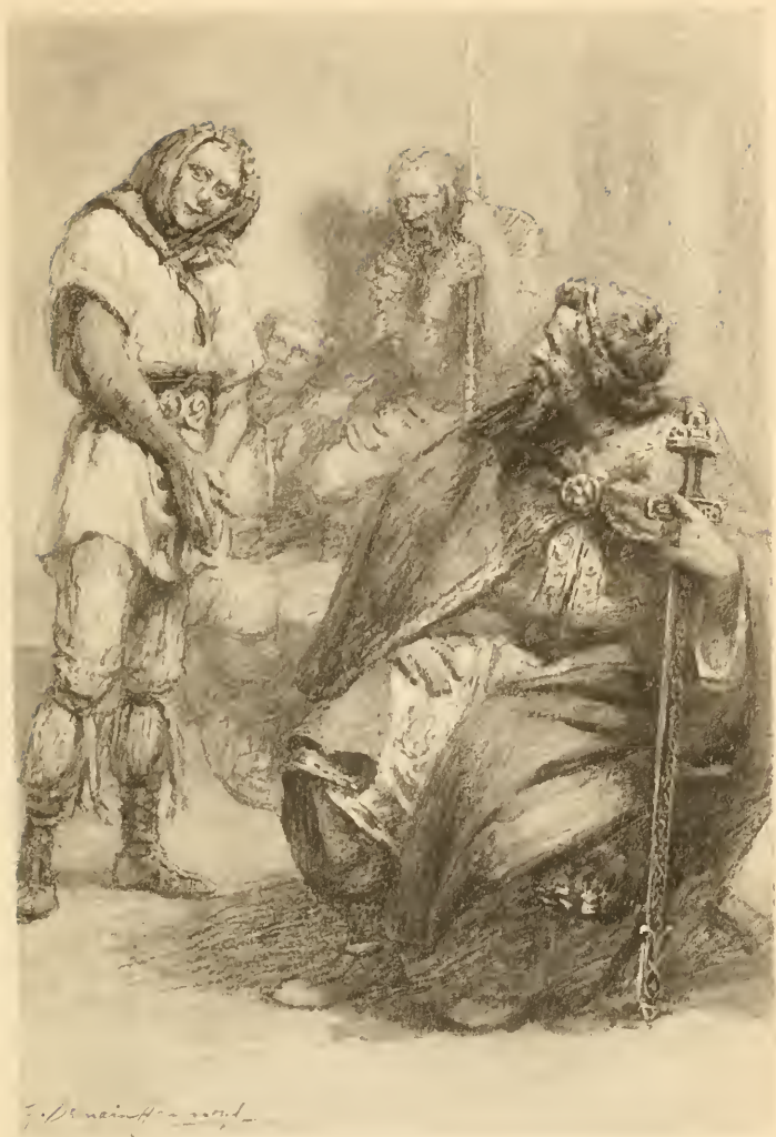
The spy shifted his feet, and looked uncomfortable.