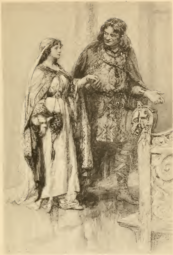
Rolf and the King's daughter, Gisla.