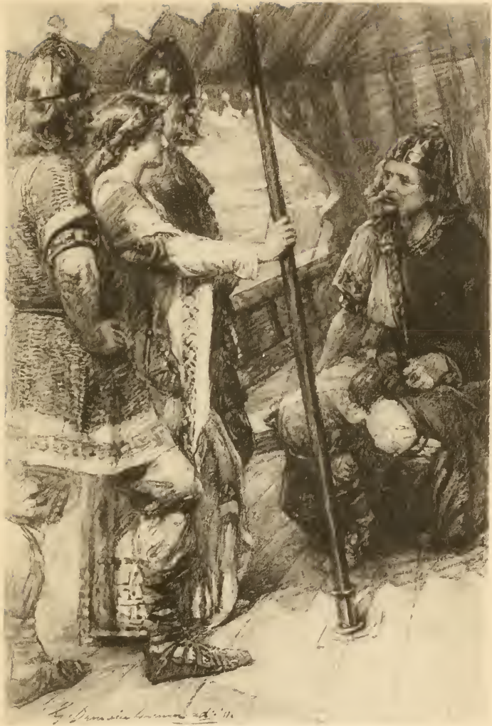
They brought Gunnhild to Eric.