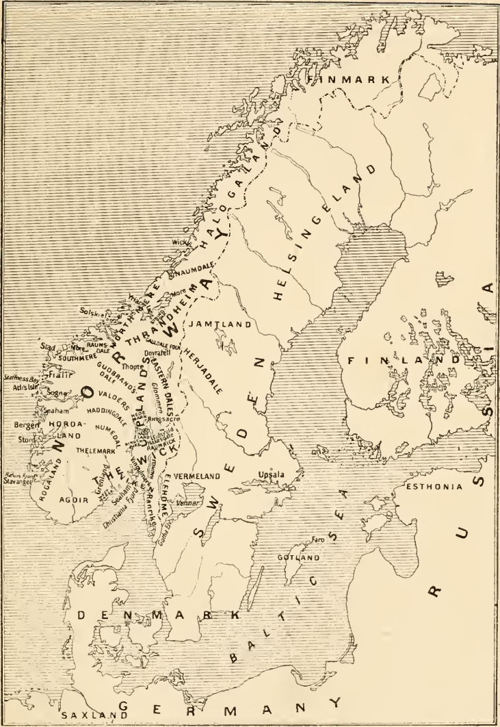
NORWAY IN THE TIME OF HARALD